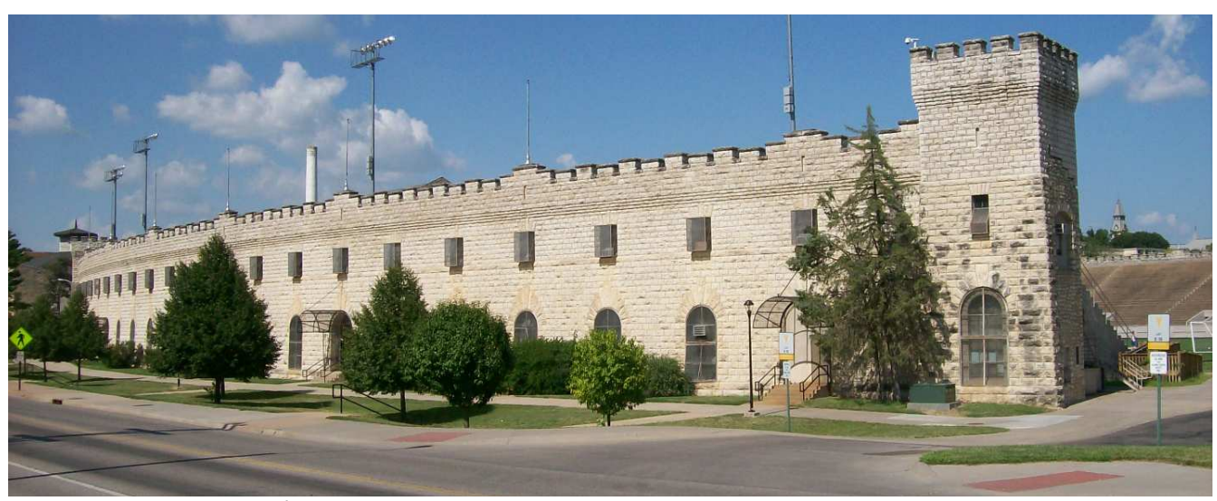
West Entrances to West Stadium

Phase II's general use classrooms are essential to effective scheduling of undergraduate level classes. General teaching space is at a premium and the loss of the three general use classrooms in East Stadium will make enrollment more difficult for currently enrolled students. The addition of public restrooms and storage spaces for Memorial Stadium's playing field will address the issues of public urination in West Stadium's concourses and the illegal storage of items that violate the fire codes. The installation of an ADA compliant elevator will prepare West Stadium's Mezzanine/Second floor for future offices.