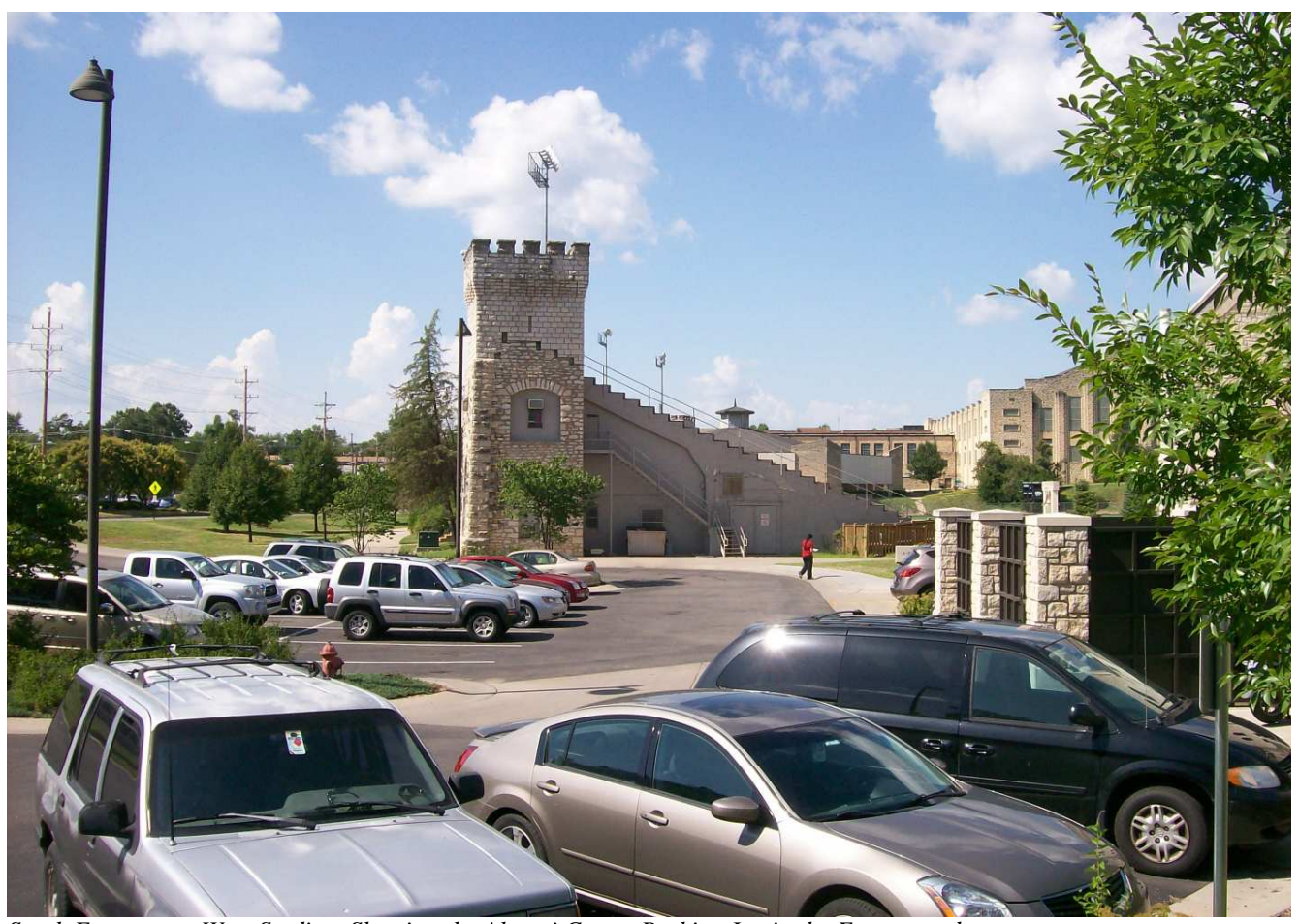
South Entrance to West Stadium Showing the Alumni Center Parking Lot in the Foreground.