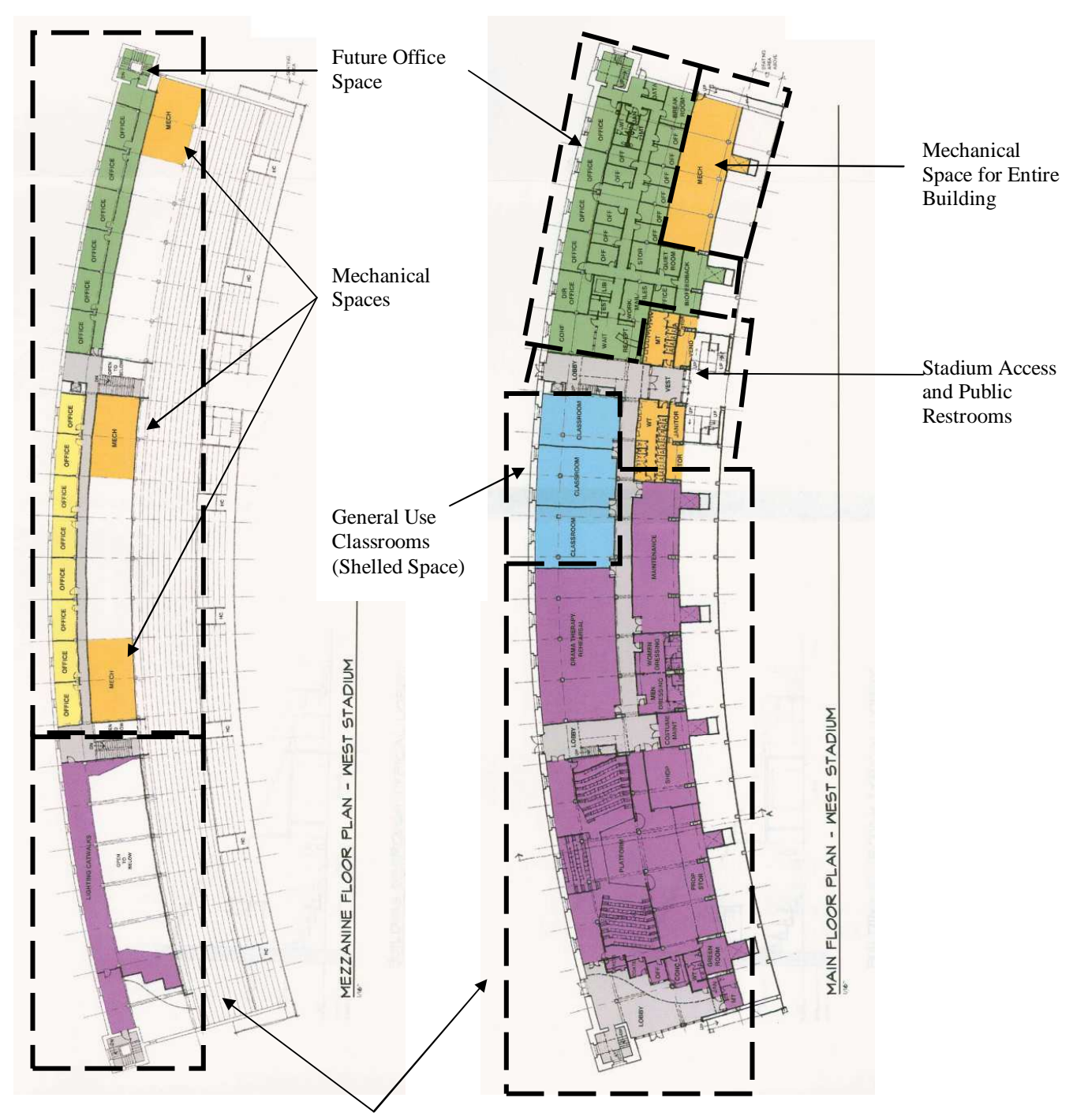
Purple Masque Theatre: theater, lobby & catwalk areas