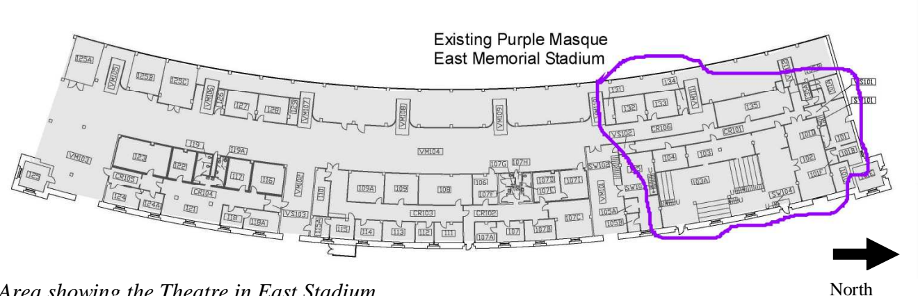
Area showing the Theatre in East Stadium

At present, the Art Department is the only remaining occupant of this facility. The Division of Facilities is currently involved in transferring their teaching and office spaces to Willard Hall. That move will be completed by August 2010. Beginning in September of 2010, West Stadium will be empty of occupants and readily available for renovation.